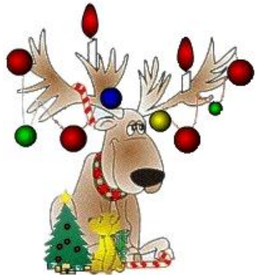
FIGURE #1: (Advanced 1)

Chain the Lady over, CHAIN EM' BACK And then PROMENADE her I'm getting' nuttin' for Christmas Cause I have been nuttin' but bad